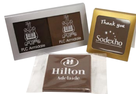
Milk or Dark Logo Chocolates

Chocolatier Australia have worked with other quality Australian companies such as De Bortoli and PayPal to create desirable seasonal products for the premium retail market.