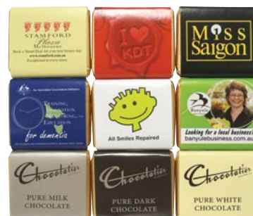
Personalised Wrapped Chocolates

Single Gift Box & Twin Pack available in Gold, Silver or Ivory Packaging